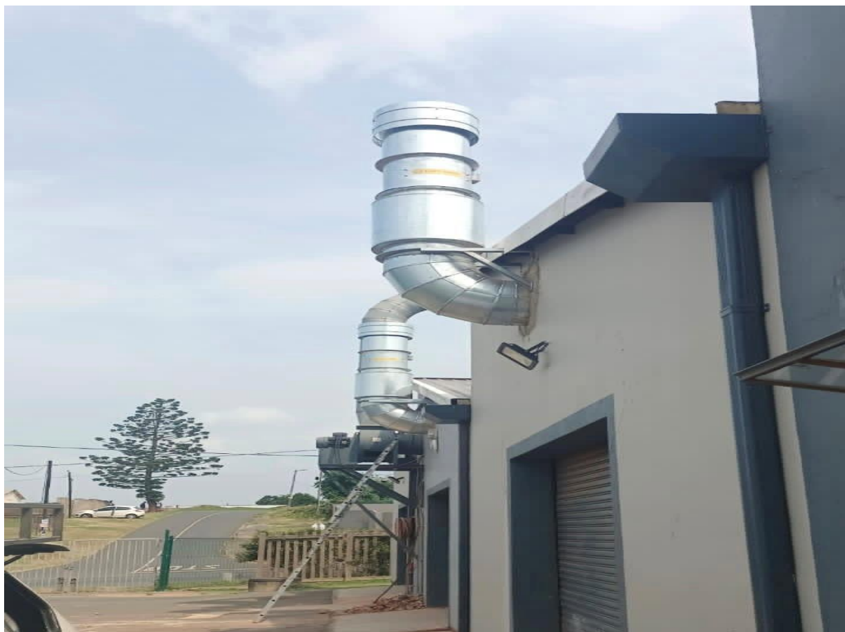
New Installation of Ventilation Systems Ntuzuma Tvet College