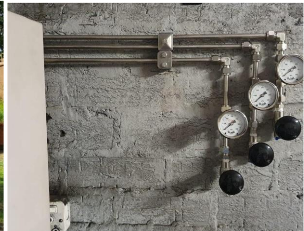
CONSTITUTION HILL MAINTENANCE PROJECT