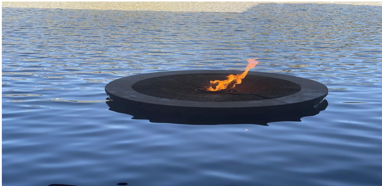
Freedom Park Democracy Eternal Flame